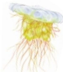
LION'S MANE JELLYFISH