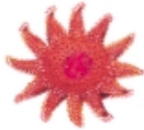
SPINY SUN STAR