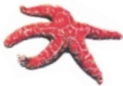
OCHRE SEA STAR