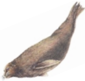
STELLER SEA LION