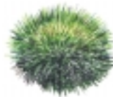
GREEN SEA URCHIN