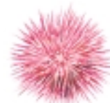
PURPLE SEA URCHIN