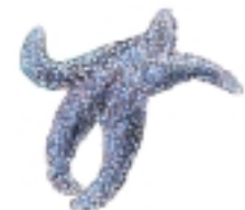
SPINED SEA STAR