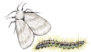
TENT CATERPILLAR MOTH