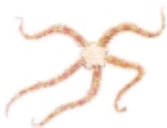
DAISY BRITTLE STAR