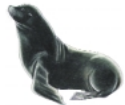
CALIFORNIA SEA LION